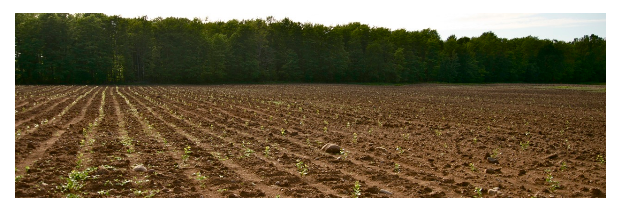
Figure 3. Early growth of cuttings at the Redridge site (photo taken in July 2011).

Weed control through initial site preparation was very effective (Figure 3). Establishment and early survival of the poplar cuttings was very high, exceeding 95% of the stock planted.